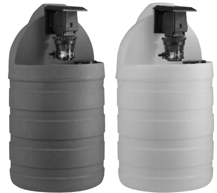
30-Gallon (113.6 Liters)