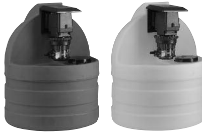
15-Gallon (56.8 Liters)