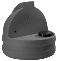
7.5-Gallon (28.4 Liters)