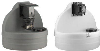
7.5-Gallon (28.4 Liters)